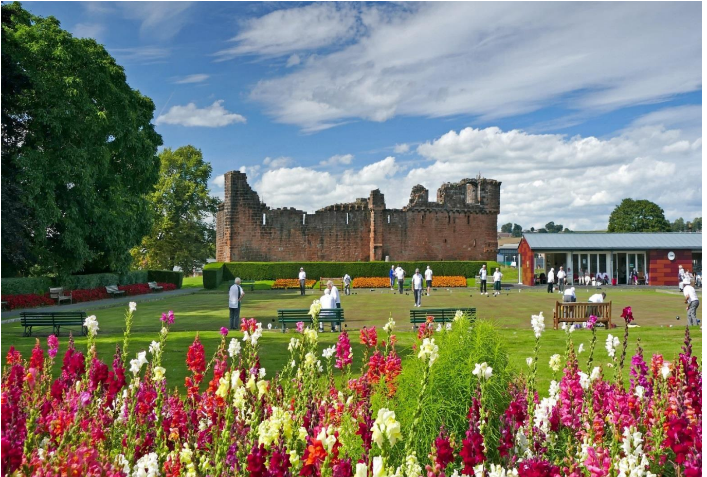
Castle Park Bowling Green, Penrith