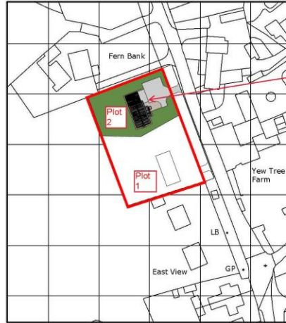
Location Plan Scale 1:200