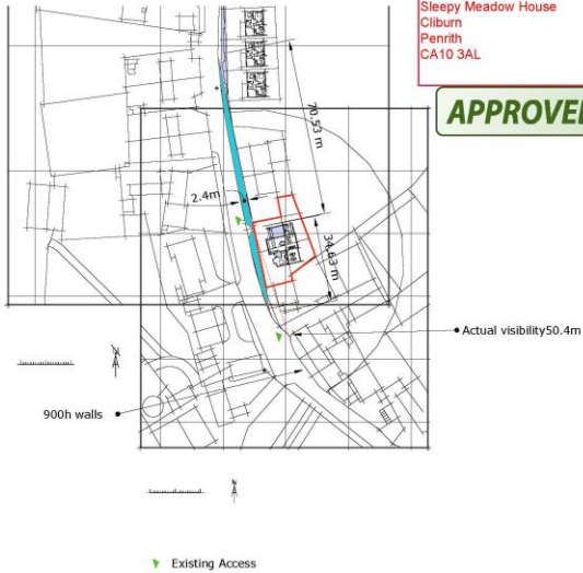
Visibility Plan 1:1250