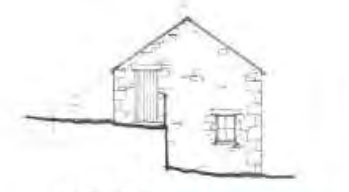
END ELEVATION N.W. KEISLEY FARM

STREET NAMING AND NUMBERING CONVERSION OF AGRICULTURAL BUILDING TO HOLIDAY LET SNN REF: 17/8018 PLANNING REF: 09/0784 GRID REF: 371188-523785 RUM BUSH COTTAGE KEISLEY FARM MURTON APPLEBY-IN-WESTMORLAND CA18 8NF