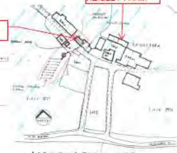
LOCATION PLAN. 1:1250