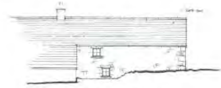
REAR ELEVATION 1/4E. 1:100