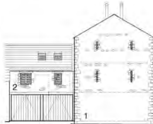
North Elevation scale 1/100

All panels to be double glazed in clear multifunctional glass, laminated clear safety glass to all doors and glazed screens.