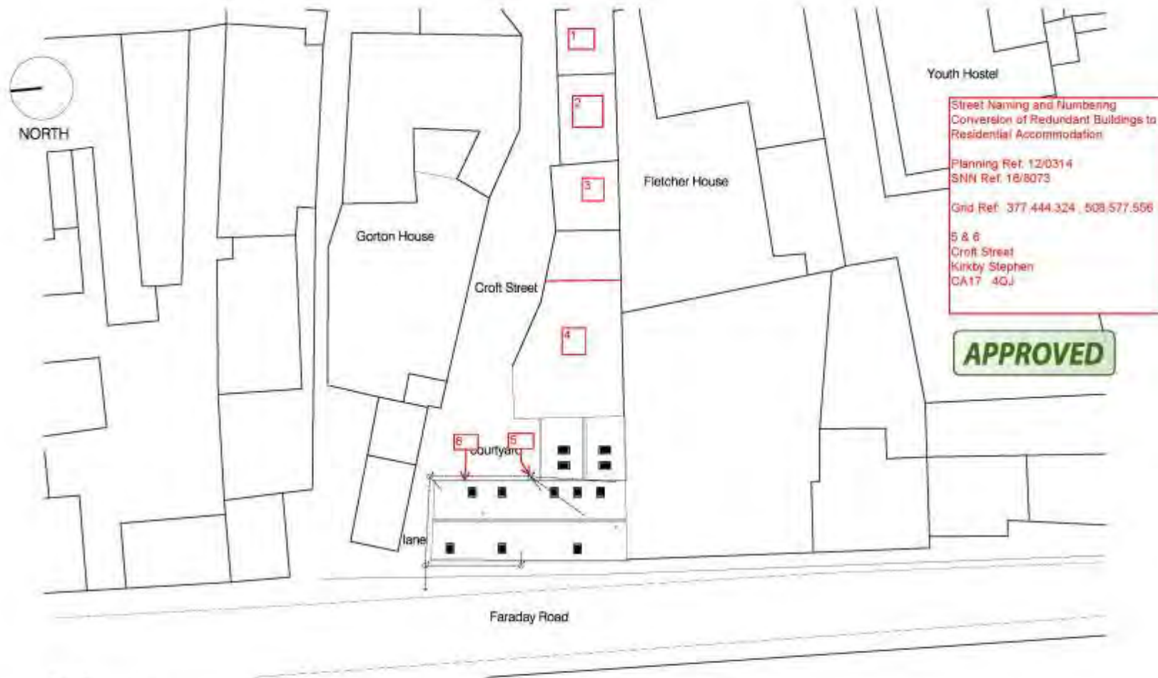
Site Plan scale 1:250