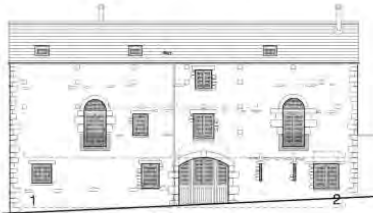
West Elevation scale 1/100

New traditional timber boarded garage to be purpose made and finished with a proprietary microporous timber stain, colour: buff/brown.