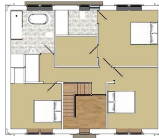
Proposed First Floor Plan Scale 1:100