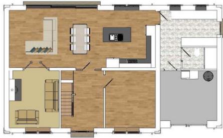
Proposed Ground Floor Plan Scale 1:100