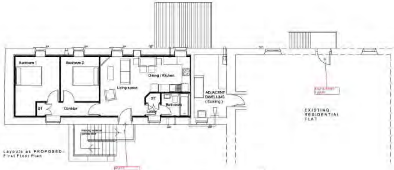
Layouts as PROPOSED - First Floor Plan