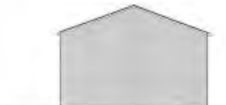
END ELEVATION (NORTH) 1:100