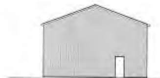
END ELEVATION (SOUTH) 1:100