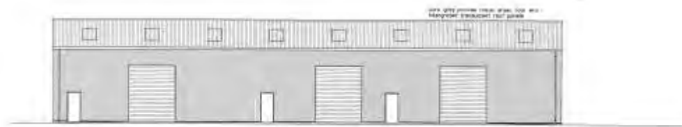
FRONT ELEVATION (WEST) 1:100