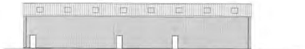
REAR ELEVATION (EAST) 1:100