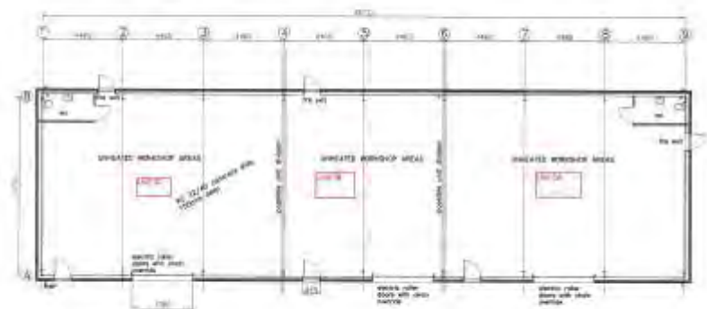
FLOOR PLAN 1:100