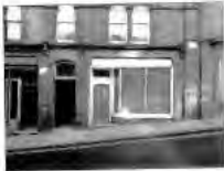
No 4 Ground and First Floor