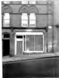
No 4 Ground and First Floor