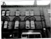
No 4 First and Second Floor

Street Elevation with Annotations Penrith, 06/12/2016 16/8098 4, 5A and 5B Castlegate Penrith CAX3 1-2