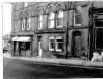
No 1 and 2