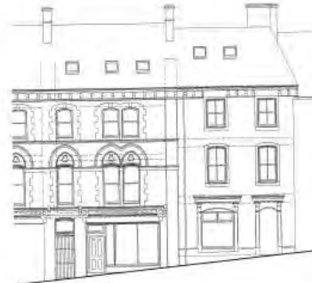
Street Elevation EXISTING