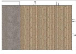
Existing First Floor Plan Scale 1:100