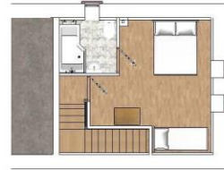
Proposed First Floor Plan Scale 1:100