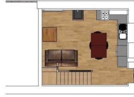
Proposed Ground Floor Plan Scale 1:100