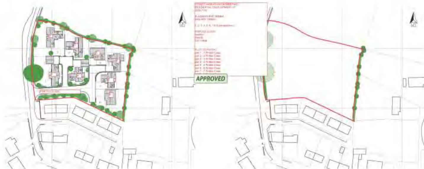
PROPOSED BLOCK PLAN SCALE 1:500