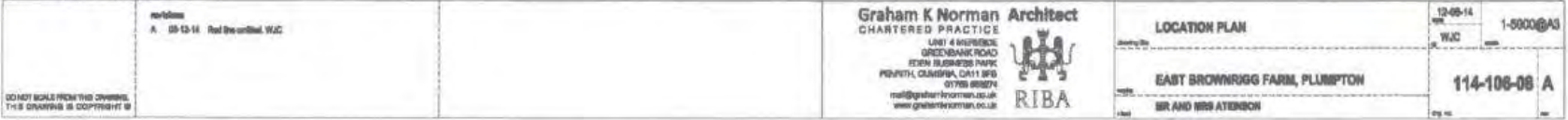
Location Plan 1:5000