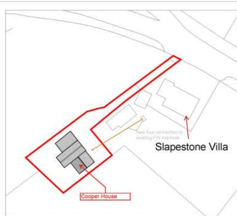
BLOCK PLAN 1:500

STREET NAMING AND NUMBERING CONVERSION OF EXISTING BARN TO RESIDENTIAL DWELLING