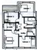
unit A first floor plan (unit B handed)