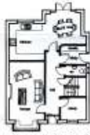
unit A: ground floor plan (unit B handed)